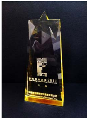
“Hong Kong Outstanding Enterprises 2011”