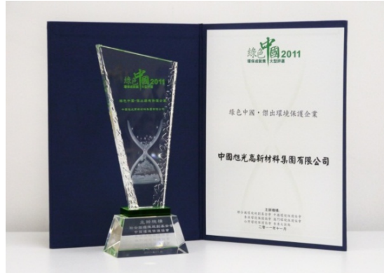
“Green China 2011 – Outstanding Enterprises in Environmental Protection”